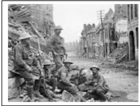
Members of the 49 th Battalion in Peronne.