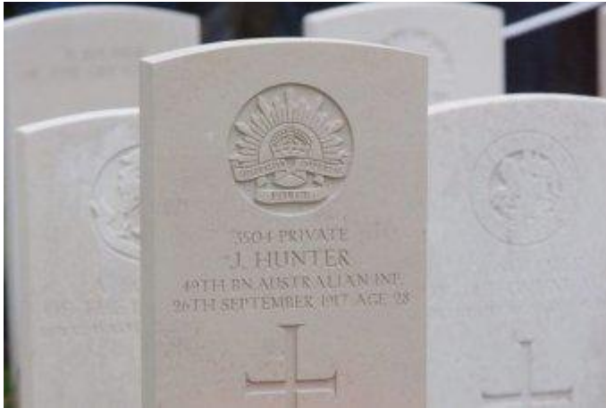
Photo: The grave of an Australian soldier during the re-burial ceremony in Zonnebeke

Five Australian World War I soldiers have been re-buried with full military honours in a Commonwealth war cemetery in Belgium.