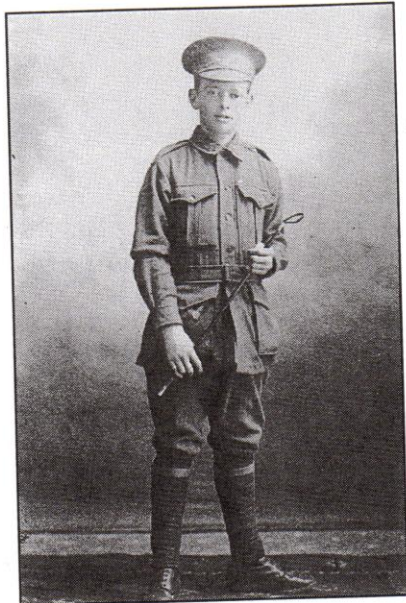
World War I

Born in Bundaberg and educated at Central School from 1905 through to 1910. Don't know any more about his childhood, but was a Shop Assistant when he enlisted in Brisbane in the army in World War I on 10.9.1915, just before turning 18. Embarked from Australia on board Arcerdian on 28.3.1916 to Egypt and then to France with the 15 th Reinforcements to the 9 th Battalion on 16.9.1916 to fight in the field. He was hospitalised with Influenza in November and transferred to hospitals at Amiens, Havre, Etretat, and Etaples before embarking from Calais to a hospital in England in February 1917.